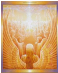
The way of an Angel 24 th to 26 th August