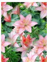
Consider the Lillies 17 th to 19 th September

If you would like to receive copies of the most recent brochure for yourself or to pass onto friends then please let us know.