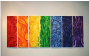
House of Colour 27 th to 1 st September